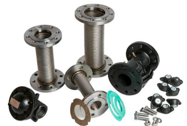
Installation Kit Included with all Package Gas Boosters.

Dimensional Data diagrams available upon request.