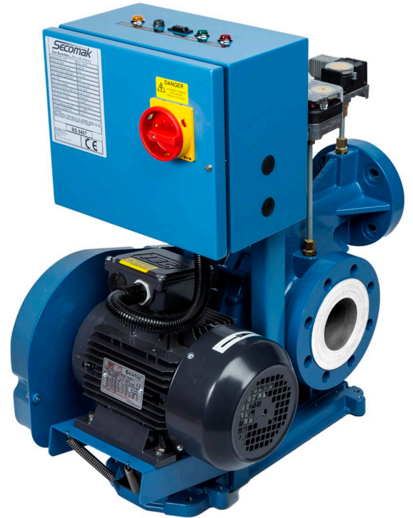
Product supplied may differ from image based on pressure requirements. Image represents Package Gas Booster including controls.