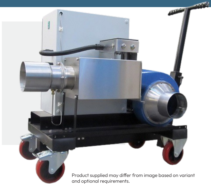
Product supplied may differ from image based on variant and optional requirements.

The Heat Pack 36 is a complete and ready-to-install industrial hot air blower. With a rated heat output of 36kW , the system includes all you need for precisely controlled hot air.